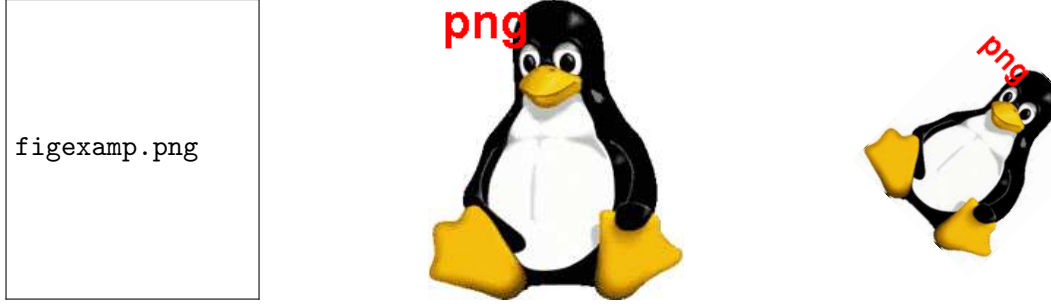
Figure 1 – same figure with draft option (left), normal (center) and rotated (right)