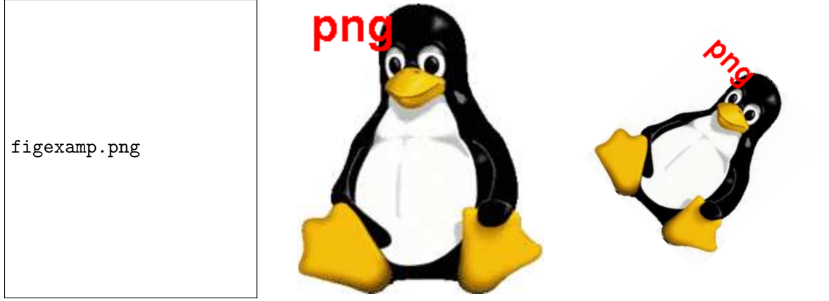
Figure 1 – same figure with draft option (left), normal (center) and rotated (right)